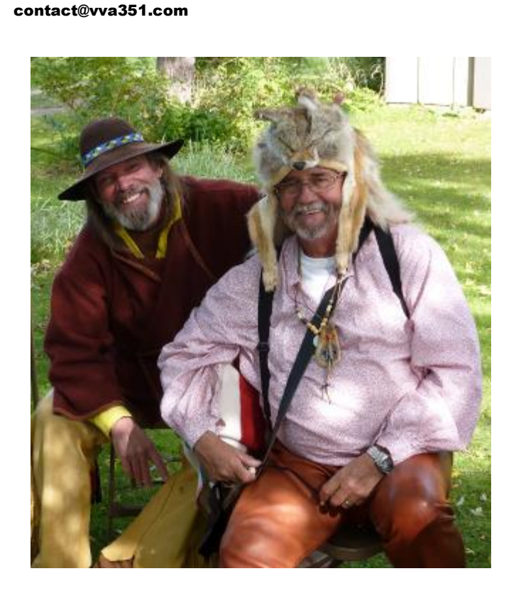
Fox Valley's Only Chartered Vietnam Veterans Organization Serving Area Veterans Since 1987