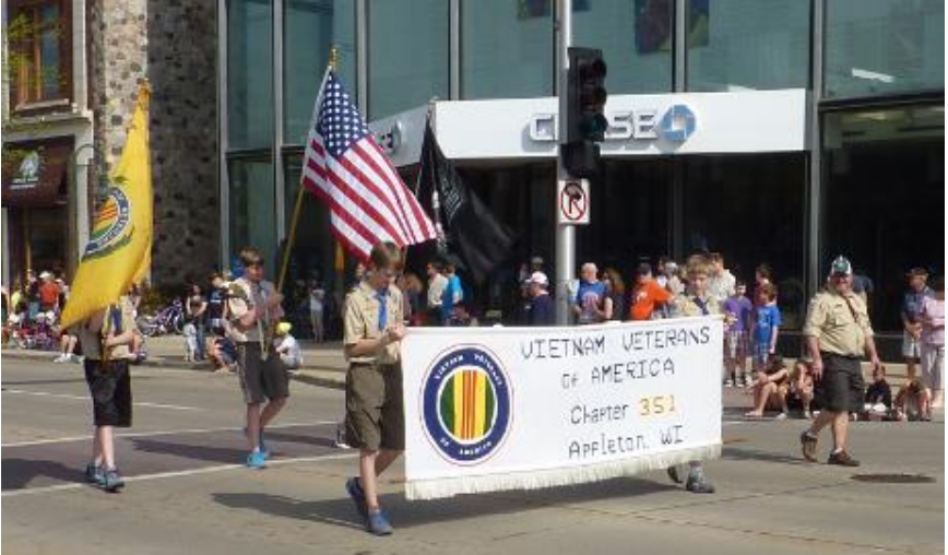
Chapter's Colors carried by Boy Scout Troop 57.